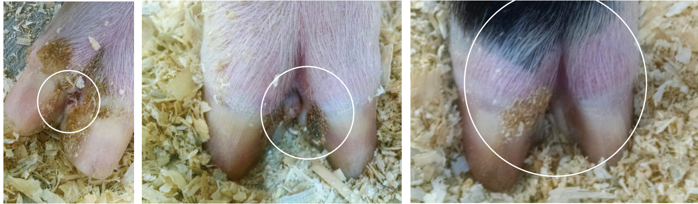
Lesions on the hoof or hyperemia of the coronary band above the toes should first be investigated to ensure FMD is ruled out.