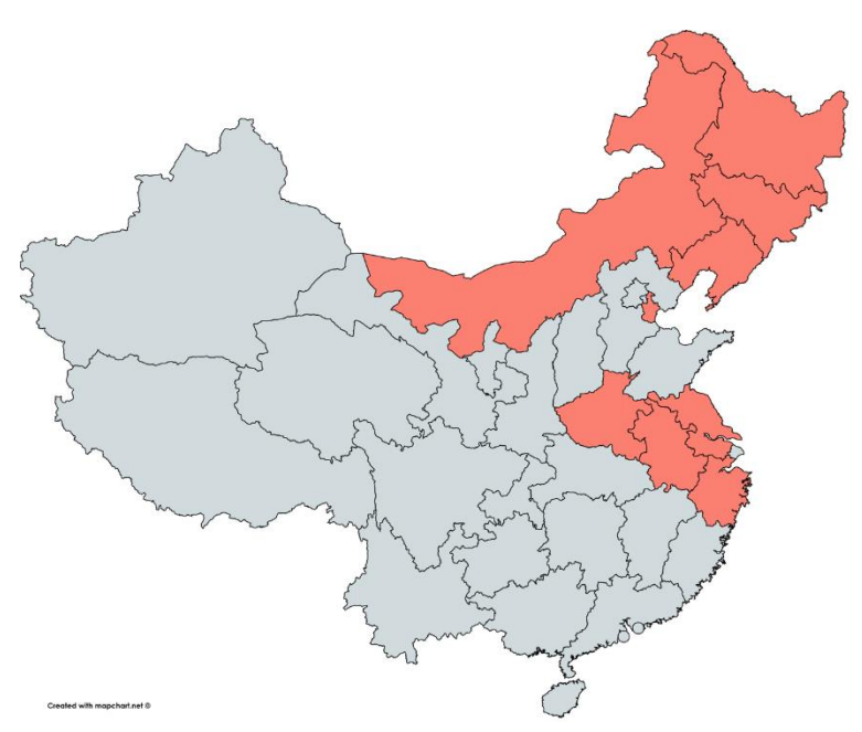
Figure 1: Chinese provinces with reported ASF outbreaks, 9 in total: Lianoning, Henan, Jiangsu, Zhejiang, Anhui, Heilongjiang, Inner Mongolia, Jilin, and Tianjin.

Since last August, 30 outbreaks of ASF have been reported in China spreading through nine provinces (Figure 1). So far in October, seven outbreaks occurred, five of them in the province of Liaoning in the northeast of the country where the first case was reported two months ago. This peak in the number of outbreaks suggests the situation still remains far from under control (Figure 2).