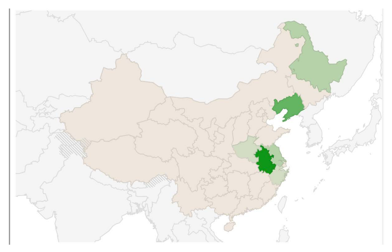
Figure 2: Chinese provinces with reported ASF outbreaks (Lianoning, Henan, Jiangsu, Zhejiang, Anhui, Heilongjiang). The intensity of the green shade depicts the number of culled animals, with the Province of Liaoning (darkest green) showing the highest cull rate.